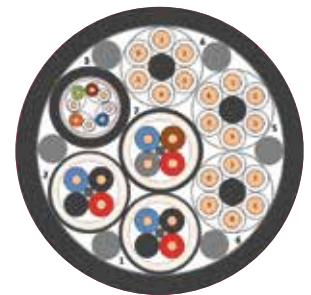
BETAtrans® GKW-ENX flex R black 3 \times (6 \times 1.5) + 1 \times (4 \times (2 \times \text{AWG } 26/7)St)C 100 Ω GigaCAT 7+ 2 \times (2 \times 0.5 + 1 \times 0.5 \text{ mm}^2)C 120 Ω MVB+ 1 \times (4 \times 0.5)C 120 Ω MVB